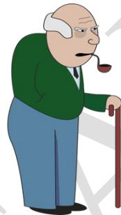
HELPING THE ELDERLY