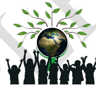
WILDLIFE CONSERVATION PROJECT