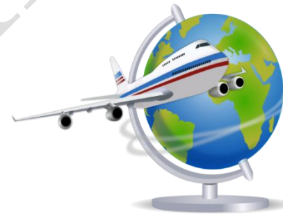
TRAVELLING ACROSS THE WORLD